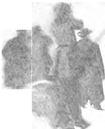
Three people in heavy winter clothing standing in a snowy, mountainous landscape.